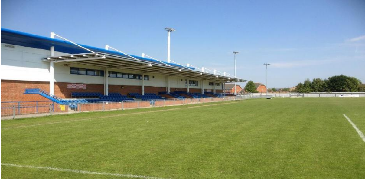
The new Stand at The Gore Ground

Follow this road through the traffic lights, under the railway bridge, over the double mini roundabouts passing the petrol station on your right, past the Brickmakers Arms on the right, past The Pheasant pub on your left, straight through the double roundabouts and then fork right into Wymers Wood Road. Look for the sign Pines Hotel. The entrance to the ground is 50 yards on the right after turning into Wymers Wood Road.