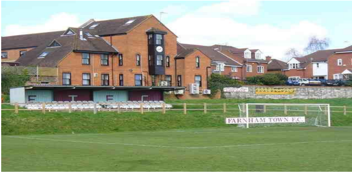
The Enclosure & Stand